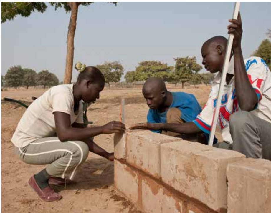
Trainee masons: A woman trainer in Benin provides advice

Before training starts, there are a set of crucial points to consider in ensuring that the training is accessible for all trainees, especially women.