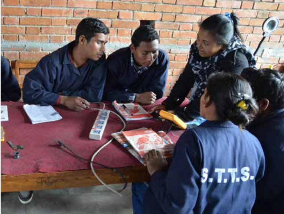
Trainee electricians: A woman trainer in Nepal explains the concept of electrical circuits.

Swiss Agency for Development and Cooperation SDC