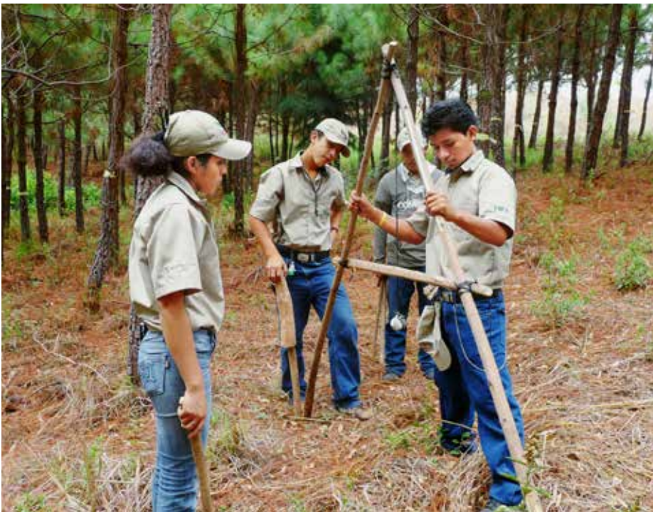
Trainee land surveyors: Young people in Guatemala learn skills for natural resource management