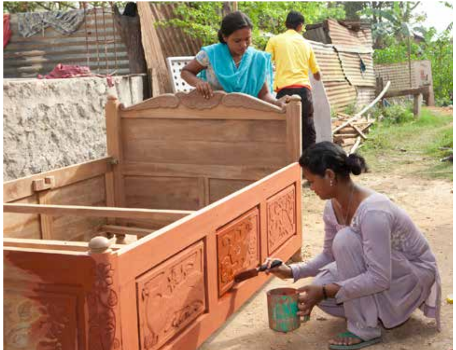
Trainee carpenters: Two young women of the Tharu ethnic minority in Nepal learn new skills

This is usually not a concern for trades with